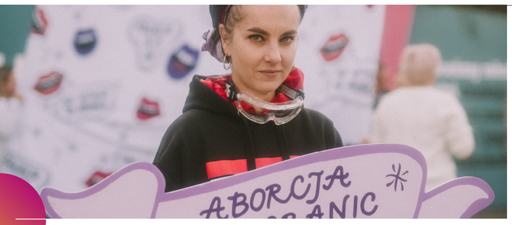
Aborcyjny Dream Team